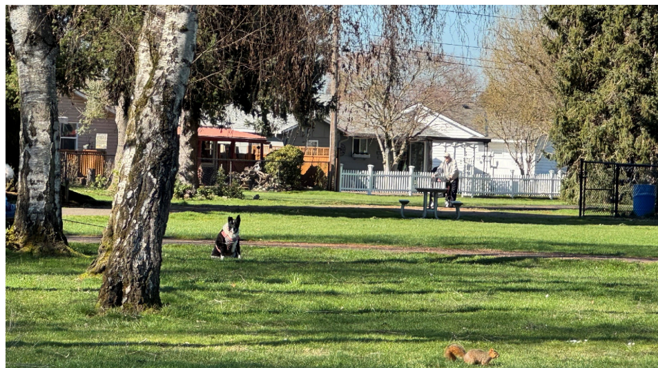
People, dogs, and squirrels all enjoying the Sun.